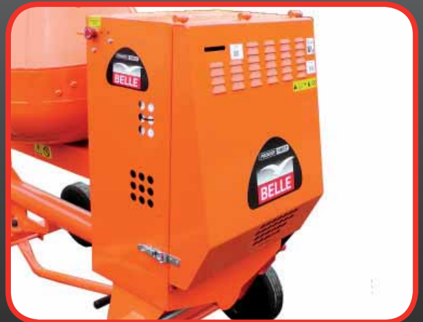
Lockable Engine Cover